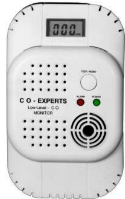
CO Experts model