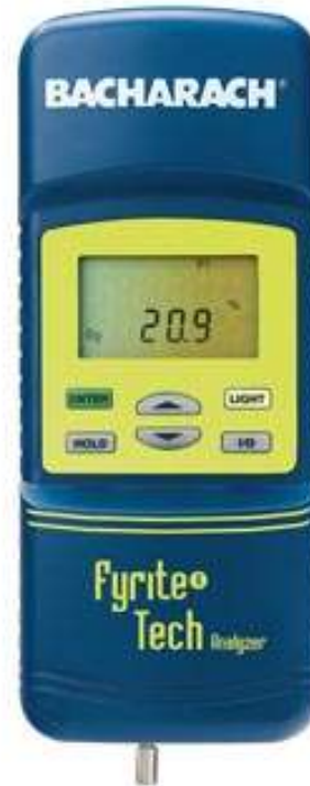
Bacharach Fyrite Tech