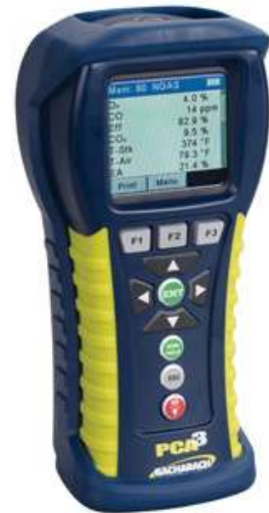
Bacharach PCA 3