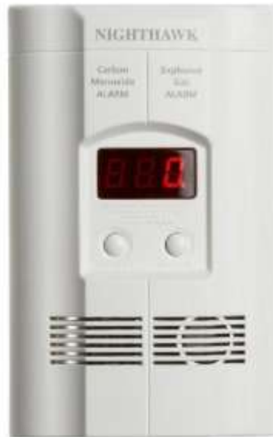
Kidde Nighthawk model