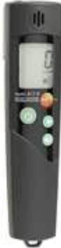
Testo CO Stick