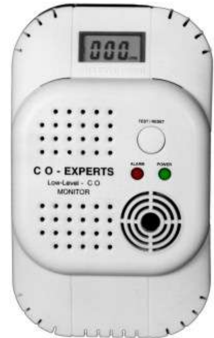
CO Experts model