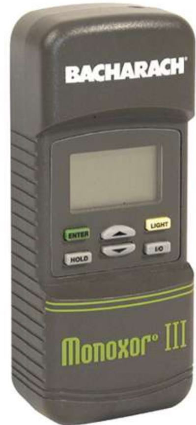
Bacharach Monoxor III