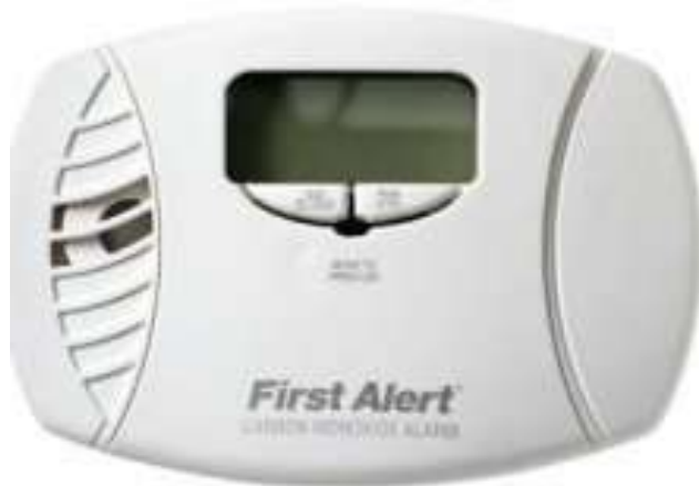
First Alert model